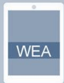
Wireless Emergency Alerts