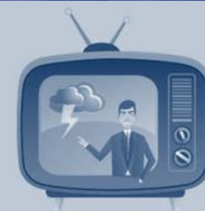
Local TV and Radio