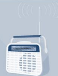
NOAA Weather Radio